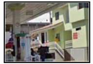
BUENOS AIRES SERVICIOS, S.A. DE C.V. Blvd. Guillermo Batiz Paredes No. 1100