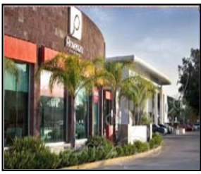
PROVENZA CENTER (Entrance)