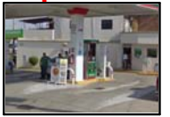
PETROBARRANCOS, S.A. DE C.V. Av. Benjamin Hill No. 5602