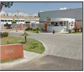
LA TIJERA PARQUE INDUSTRIAL (Entrance)