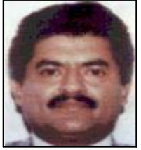
Juan Jose ESPARRAGOZA MORENO (a.k.a. "El Azul")