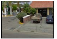
GASODIESEL Y SERVICIOS ANCONA, S.A. DE C.V. Manuel J. Clouthier No. 1800