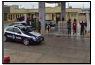
GASOLINERA Y SERVICIOS VILLABONITA, S.A. DE C.V. Av. Alvaro Obregon No. 6040