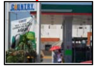
SERVICIOS CHULAVISTA, S.A. DE C.V. Blvd. Las Torres No. 2622 Pte.