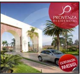
PROVENZA RESIDENCIAL (Entrance)