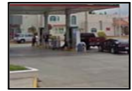
GASOLINERA ALAMOS COUNTRY, S.A. DE C.V. Blvd. Pedro Infante No. 3050