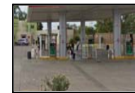
ESTACIONES DE SERVICIOS CANARIAS, S.A. DE C.V. Blvd. Enrique Felix Castro No. 1029