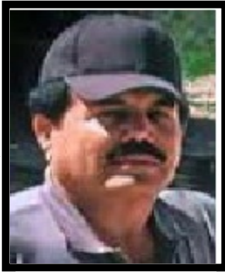
Ismael ZAMBADA GARCIA a.k.a.: "Mayo Zambada"

Identified by the President as a Significant Foreign Narcotics Traffickers on May 31, 2002