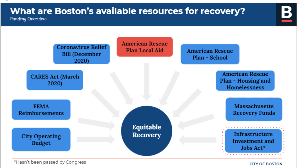
Figure 2: Available Resources