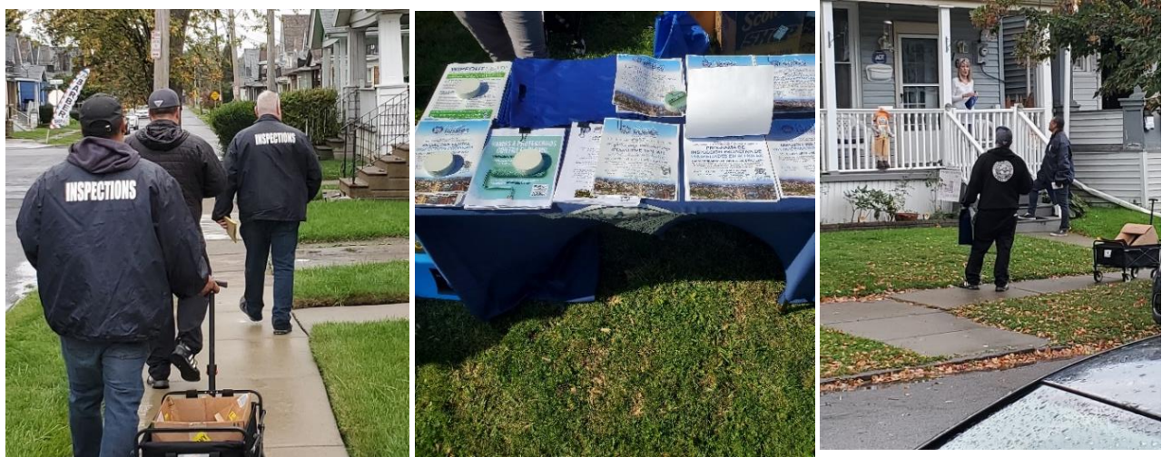
City of Buffalo Inspectors during residential visits and Informational Flyers in multiple languages

At these events, the team provides home cleaning supplies (donated by collaborating organizations), lead awareness materials, and information on accessing funding for lead remediation, including participation in the PRI program. Other outreach activities include Block Walks and door-to-door canvassing. The program accommodates the multilingual population by translating informational materials into six languages (Spanish, Burmese, Karen, Arabic, Swahili, and Bengali) and using a language interpretation line as needed. The funding has allowed the City to increase the number of inspectors, significantly enhancing the program's reach. This includes completing all PRI inspections requested through the Mayor's 311 Call and Resolution Center, distributing notices to tenants and landlords about inspections, ensuring that all licensed contractors in the City are RRP Certified (Renovation, Repair, and Painting Program), and partnering with the Attorney General's Office and ECDOH to prosecute landlords responsible for lead poisoning of children.