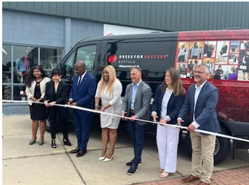
Dress for Success Buffalo Mobile Boutique Unveiling

This program provides wraparound services for City residents in need of financial and educational support while they are enrolled in job training programs. By providing direct, flexible support, the City intends to help ease a person’s transition from a lower-paying job to a higher-paying, career-oriented position during the job training period. Four subrecipients, African American Cultural Center (AACC), Dress for Success Buffalo (DFSB), The