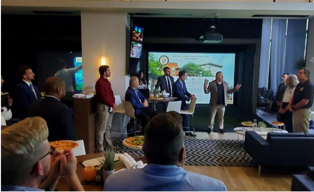
Figure 4 SLFRF Grantee, Morris County Chamber of Commerce, organized a Small Business Town Hall in Morristown, NJ to promote the Small Business Grant Program.