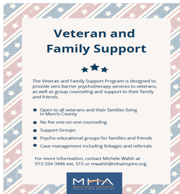
Figure 3. Flyer for Veteran Behavioral Health Program - Veteran and Family Support

On January 24, 2024, the County of Morris adopted Resolution RES-2024-134, which authorized a contract be awarded to Mental Health Association of Essex and Morris, Inc. to provide Veterans Mental Health and Social Services support for an amount NTE $102,120.00.