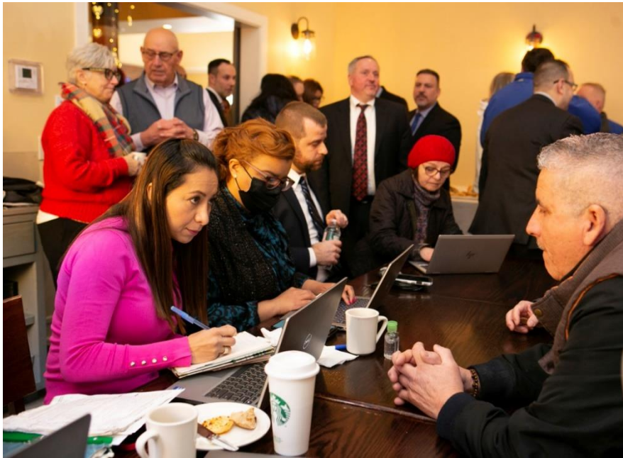
Figure 1. SLFRF Grantee, Morris County Chamber of Commerce, holds a community outreach event to assist business owners with the Small Business Grant application.

Morris County encourages and documents input and feedback from the County's diverse constituents and community-based organizations. The County website provides a tool for all community members to find information about public meetings, financial information, and direct-contact information. As mentioned in the Executive Summary, the COVID-19 SPAC makes recommendations to the Morris County Commissioners regarding SLFRF funding. Commissioners then hold a public meeting, consider, and incorporate public opinion, and pass resolutions to formalize actions. The Board of County Commissioners, various commissions, boards, and authorities hold public meetings that allow constituents, community-based organizations, and the community to comment on planned or current use of funds via written, oral, and other forms of input.