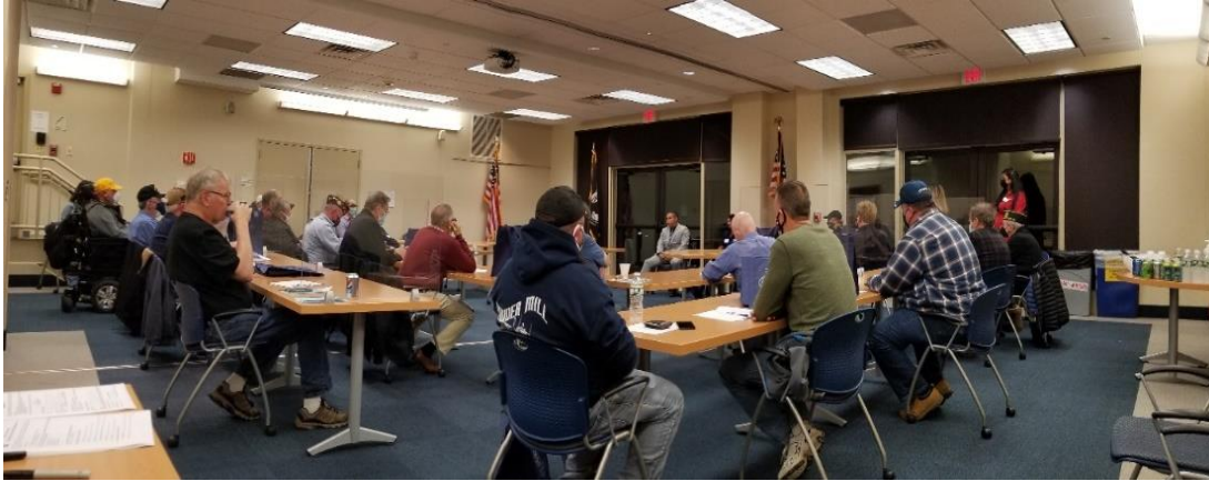
Figure 2 Veteran Behavioral Health Program - Veteran Mixer held October 2021.