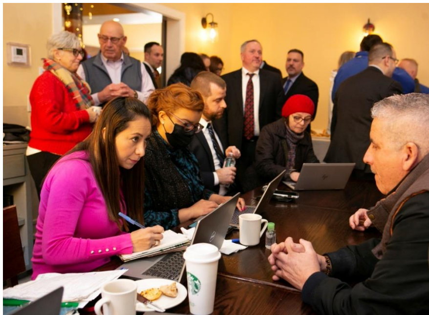
Figure 1. SLFRF Grantee, Morris County Chamber of Commerce, holds a community outreach event to assist business owners with the Small Business Grant application.