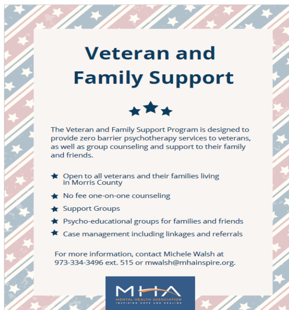
Figure 3. Flyer for Veteran Behavioral Health Program - Veteran and Family Support

Project Overview: The Commissioners adopted an overall budget of $350,000.00 for veteran-focused mental health services on September 9, 2021. The services consist of three programs: Veteran Mixer, Peer to Peer Support, and Family Services. On October 6, 2021, the County of Morris adopted resolution RES-2021-859, committing $255,000.00 for the Veteran and Family Support project. The County of Morris solicited proposals for the provision of Clinical Support and Education for the Morris County veterans and their families, titled RFP# "P22-21 Veterans & Family Mental Health Support Service". The County awarded The Mental Health Association of Essex and Morris, Inc., of Parsippany, NJ, the sole respondent, Resolution RES-2021-1061, December 8, 2021. Contract Term: January 1, 2022 through December 31, 2022.