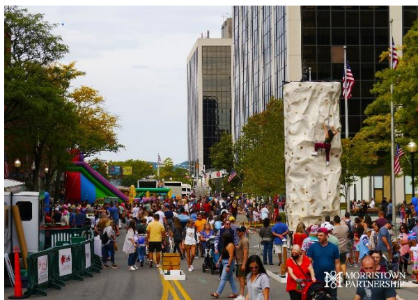
Figure 6 Kids Place at Festival on the Green

Project Overview : The Festival on the Green by Morristown Partnership is a free event for all attendees, welcoming approximately 50,000 visitors to the County seat every fall. Morristown Partnership suffered a severe loss of revenue from the COVID-19 pandemic through the lack of multiple events, including the annual Festival on the Green. The Festival on the Green supports small businesses, particularly those that buy a package price for a table, tent, and chairs to attract customers during the festival. Morristown Partnership was going to raise the 2021 participation package rates because equipment rental costs increased. On November 10, 2021, the County of Morris adopted RES-2021-945, committing $100,000.00 to keep costs to participating businesses the same as the 2019 costs. All reimbursements have been issued.