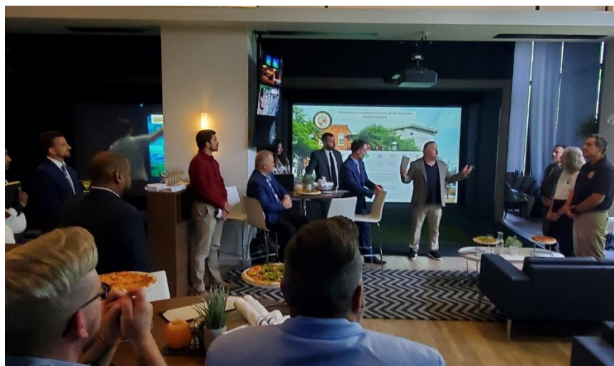
Figure 4 SLFRF Grantee, Morris County Chamber of Commerce, organized a Small Business Town Hall in Morristown, NJ to promote the Small Business Grant Program.

Project Overview: The County of Morris is proceeding with a Small Business Grant Program directing $10,000,000.00, to eligible small businesses and nonprofits. The program will provide assistance to small businesses that experienced negative economic impacts from the COVID-19 pandemic. On December 20, 2021, the County of Morris adopted RES-2021-1103, committing $84,000.00 to be directed to the Morris County Chamber of Commerce to oversee and execute the community outreach and assist small businesses with grant applications. The Chamber has hosted several town hall events, digital outreach, and grassroots efforts focused on Disproportionately Impacted Small Businesses, including Women-Owned Businesses, Disadvantaged Business Enterprises, Minority-Owned Businesses, and businesses in low-income communities.