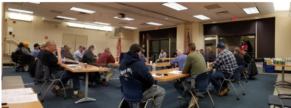
Figure 2 Veteran Behavioral Health Program - Veteran Mixer held October 2021.

Project Overview: The Commissioners adopted an overall budget of $350,000.00 for veteran-focused mental health services on September 9, 2021. The services consist of three programs: Veteran Mixer, Peer to Peer Support, and Family Services. On October 6, 2021, the County of Morris adopted resolution RES-2021-859, committing $60,000.00 for the Veteran Mixer Gatherings project. The County has hosted several mixers.