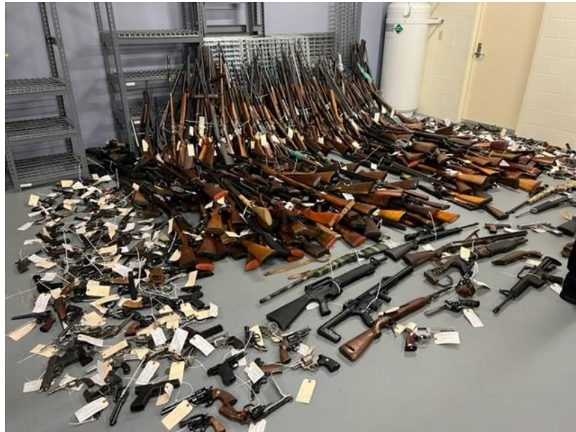
Figure 8. Firearms surrendered during the gun buyback program