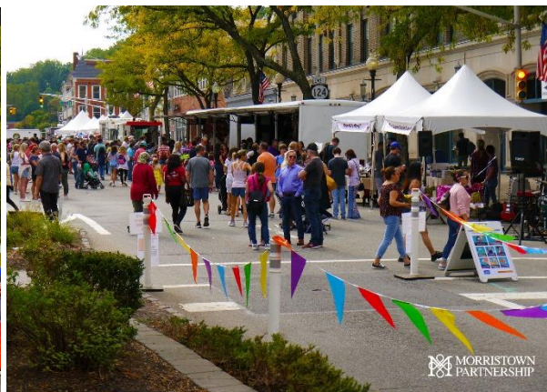
Figure 7 North Park Place at Festival on the Green