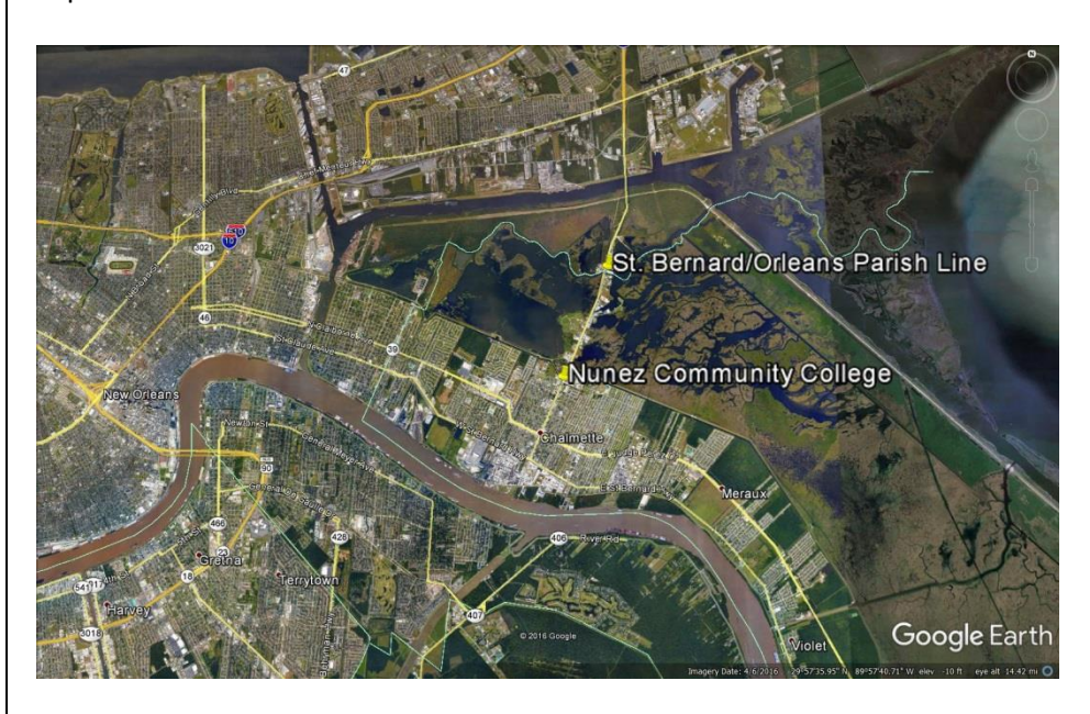
Nunez Community College Fisheries Workforce Development Program

Description: SBPG proposes to collaborate with Nunez Community College (Nunez) to design and implement a workforce development program that is focused on emerging fisheries-oriented sectors. The target audience for the program will be current commercial fishermen and their families, mid-career workers, and high school students.