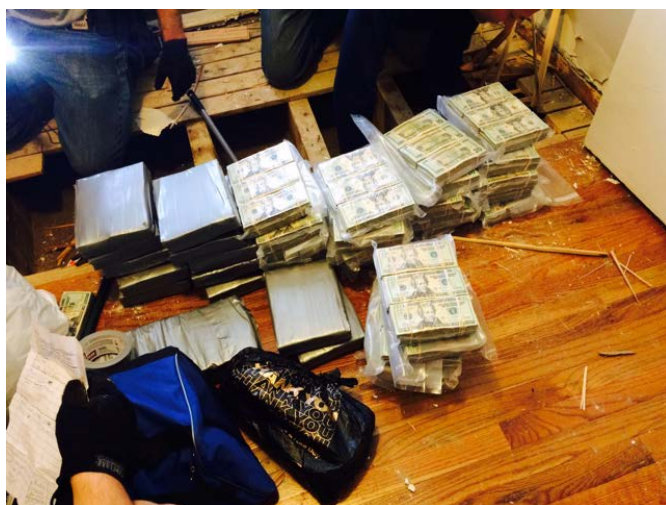
Figure 1: Currency discovered hidden beneath the floorboards.

On May 17, 2015, HSI agents in New York seized over $2 million in currency from a heroin trafficking organization. The case had begun in September of 2012, when HSI agents who were part of the El Dorado Task Force (EDTF), in conjunction with US Drug Enforcement Administration (DEA) agents, initiated a money laundering/drug trafficking investigation of heroin traffickers operating in the Bronx, NY area.