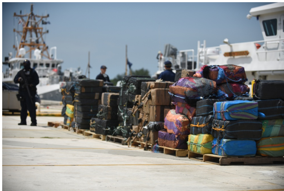
Figure 3: Approximately eight tons of seized cocaine offloaded from Coast Guard Cutter Bernard C. Webber to Coast Guard Base Miami Beach on June 13, 2016.

The drugs were interdicted in international waters of the Eastern Pacific Ocean drug transit zone off the coast of Central and South America.