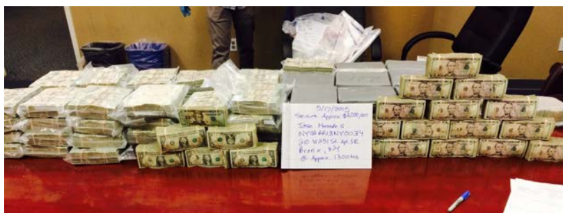
Figure 2: $2,027,643 in seized currency.

Based on information from a variety of sources, five search warrants were obtained for the addresses associated with the drug trafficking organization (DTO) in anticipation of a large shipment arriving. On May 17, 2015, a known leader of the DTO parked in front of the stash location and was approached by members of HSI New York and DEA New York. In plain sight on the passenger's seat was a small bag of heroin, which resulted in an arrest. The search warrants were subsequently executed, resulting in the discovery of approximately $2,027,643 in bundled U.S. currency hidden in a floor trap in a bedroom in the stash location. Additionally, approximately 70 kilograms of heroin were seized from a hidden compartment located in a vehicle belonging to the individual.