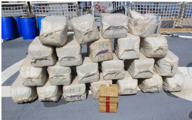
Figure 4: Bales of cocaine are shown on the deck of the Coast Guard Cutter Vigorous May 30, 2016, in the Atlantic Ocean.

The Vigorous crew conducted seven additional at-sea boardings, detaining nine suspected drug smugglers, and stopping 26 metric tons of cocaine, with a wholesale value of more than $373 million, from reaching the United States. The Vigorous also rescued three survivors who were found adrift in their vessel more than 200 nautical miles from the nearest point of land.