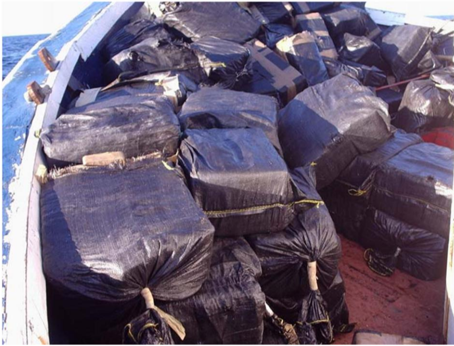
Cocaine contraband seized by the U.S. Coast Guard from the Ecuadorian fishing vessel Magallanes.