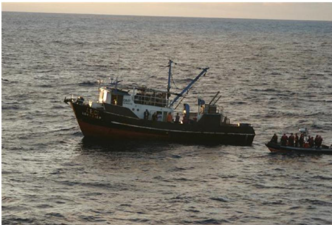
Peruvian fishing vessel Ceci boarded by CGC HAMILTON.

On July 28, 2006, the U.S. Coast Guard Cutter (CGC) HAMILTON seized over 10,300 pounds of cocaine from the Peruvian fishing vessel Ceci. The CGC HAMILTON launched its small boat with Coast Guard law enforcement personnel aboard to question the master on the nationality of the vessel and the purpose of its voyage. In the process of questioning, boarding team members noticed a large number of what appeared to be bales of contraband in plain view on the fantail of the Ceci. After the Peruvian government granted the Coast Guard permission to board and search the vessel, a sample bale was tested using a Narcotic Identification Kit that resulted in a positive test for cocaine. A total of 200 bales were seized and all 10 Ceci crew members were detained on the CGC HAMILTON until they were transferred to Peruvian law enforcement. Intelligence from the Ceci investigation later led to the arrest of 3 other suspected narcotics traffickers and the seizure of two other Peruvian fishing vessels.