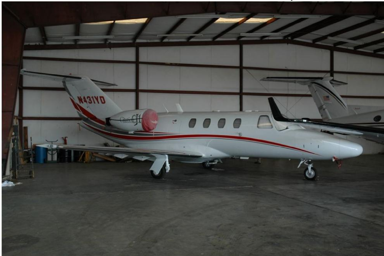
2001 Cessna aircraft seized in the Farrish investigation.

Detectives from Virginia played similar slot machines controlled by Truck Stop Games, LCC in Virginia. Subsequently, police officers executed a search warrant at the Truck Stop Games LLC offices in Chester, Virginia. Analysis of the financial records by IRS- CI revealed that Truck Stop games maintained more than 500 machines at 110 locations on 15 states. Monthly profit and loss statements showed collections of $6.3 million for seven months between the years 2002 and 2003.